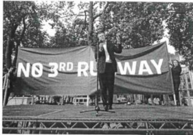
Local MP Zac Goldsmith protesting against the third runway at Heathrow Airport

Though representatives may be elected locally or regionally, if they sit in the national Parliament they are expected to represent the interests of the nation as a whole. Sometimes this may clash with the local constituency they represent, so they have to resolve the issue in their own way. For example, an MP representing a constituency near a major airport may be under pressure to oppose further expansion on the grounds of noise and pollution, but may see it as in the national interest to expand that airport. Fortunately not all issues concerning the national interest cause such a dilemma. For example, foreign policy issues usually do not have local effects.